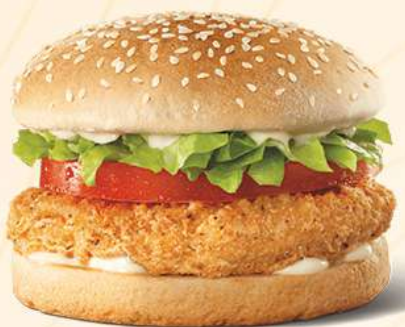
Burger & Sandwich